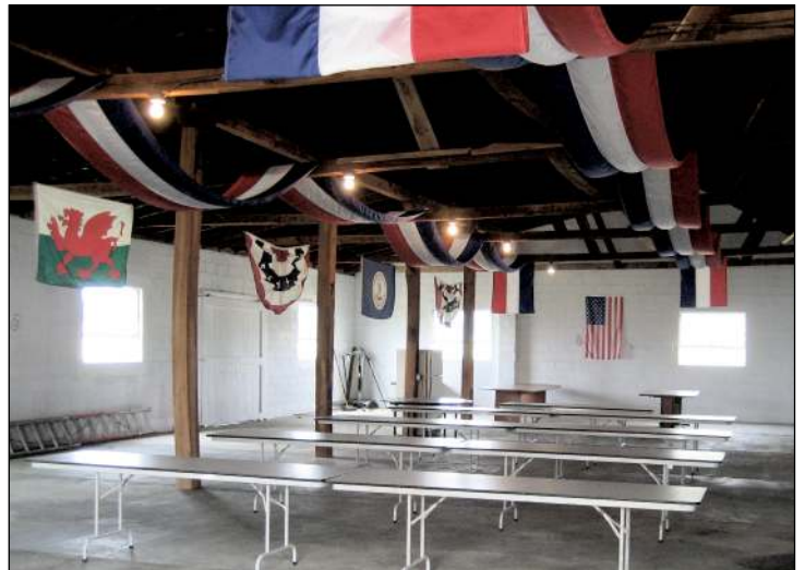
Inside the newly cleaned, painted and decorated KBA Activities Building.