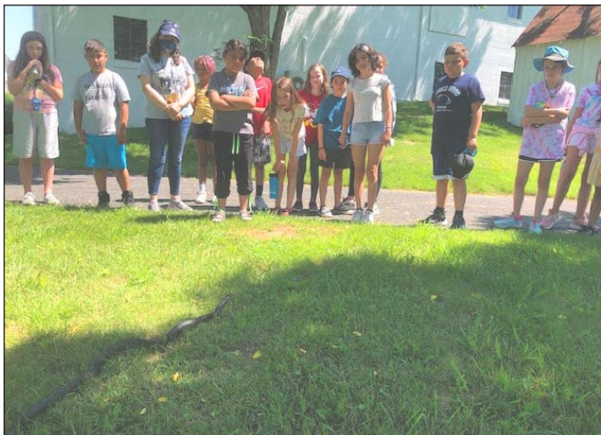
The 4th grade students stand back as a resident black snake approaches through the grass.

This "snakes on the lane" encounter is just another example of the wide range of experiences you can have when visiting wild and wooly Kernstown Battlefield on the Pritchard-Grim Farm! ■