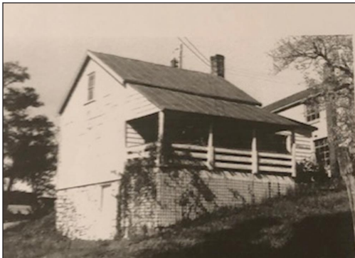
Cabin circa 1986