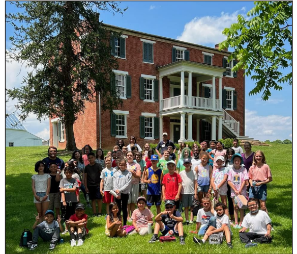
4th graders from Frederick Douglas Elementary

The students then enjoyed their lunch in the shade along Pritchard's Lane. It was a great experience for the students, teachers and our dedicated KBA volunteers. The teachers indicated that they would like to work together with us again in the future. ■