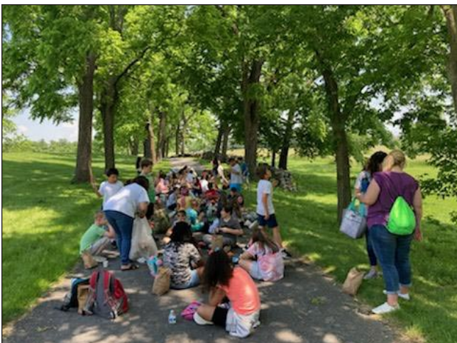
Lunch in the shade on Pritchard's Lane